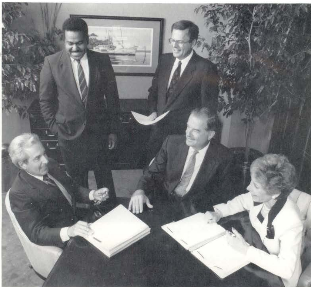
National Board of Directors