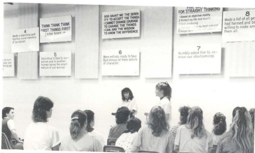
Large group therapy process

positive, and effective interpersonal skills they are learning in the STRAIGHT program. Young people return to their homes to implement the skills learned and develop a positive family relationship.