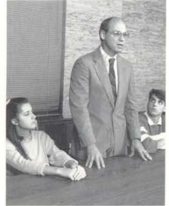
Speaker's Bureau—Sharing the STRAIGHT experience with the community

We are proud of our volunteer Community Advisory Board members whose efforts are instrumental in expanding STRAIGHT's community involvement. Community Advisory Board members generously donate their time and energy to facilitate community interaction and also assist STRAIGHT in responding to the needs of the community.