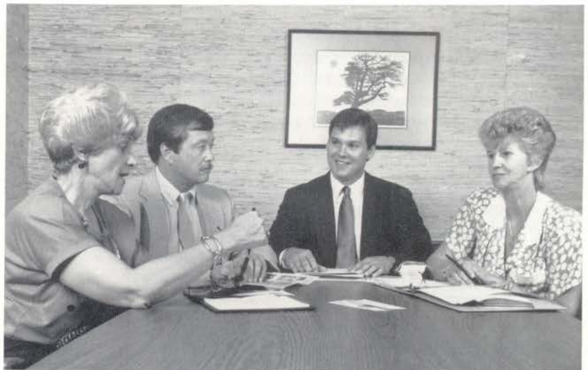
Community Advisory Board