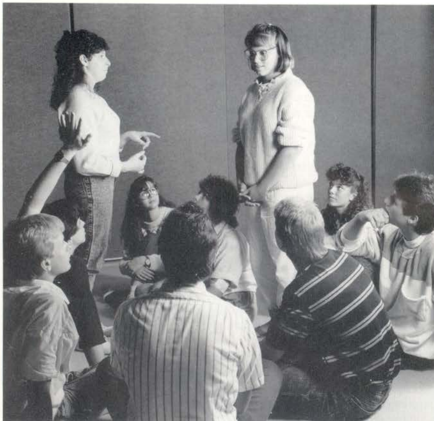
Peer support and interaction in the small group setting