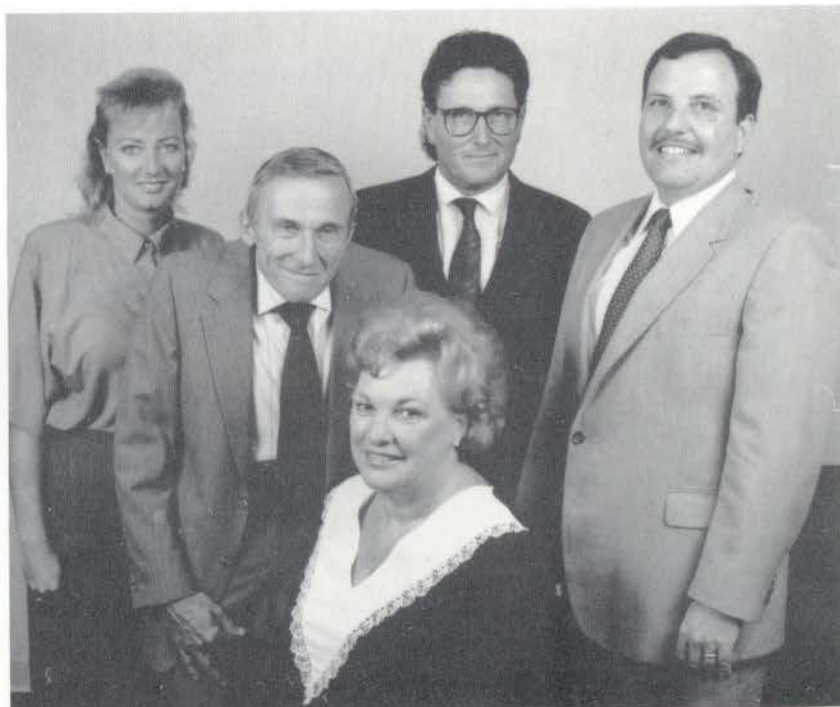
The STRAIGHT Management Team

An important aspect of the corporate function is the development and expansion of new programs. The management team works closely with communities to ensure that a facility is appropriate and that a program grows in a reasonable time frame. STRAIGHT is committed to offering the best possible treatment program to the community.