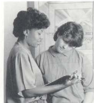
Voluntary Aftercare Program

■ Second Phase focuses on the family. The major goal for the patient is to improve and rebuild family relationships. Phase Two allows family members to apply the more appropriate,