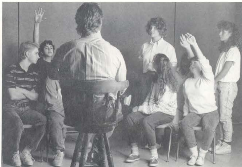
Staff directed discussion

At STRAIGHT our goal is not only to help adolescents and their families become free of drugs, but to allow them to recapture the quality of life.